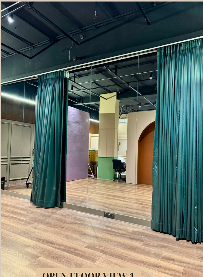
OPEN FLOOR VIEW 1