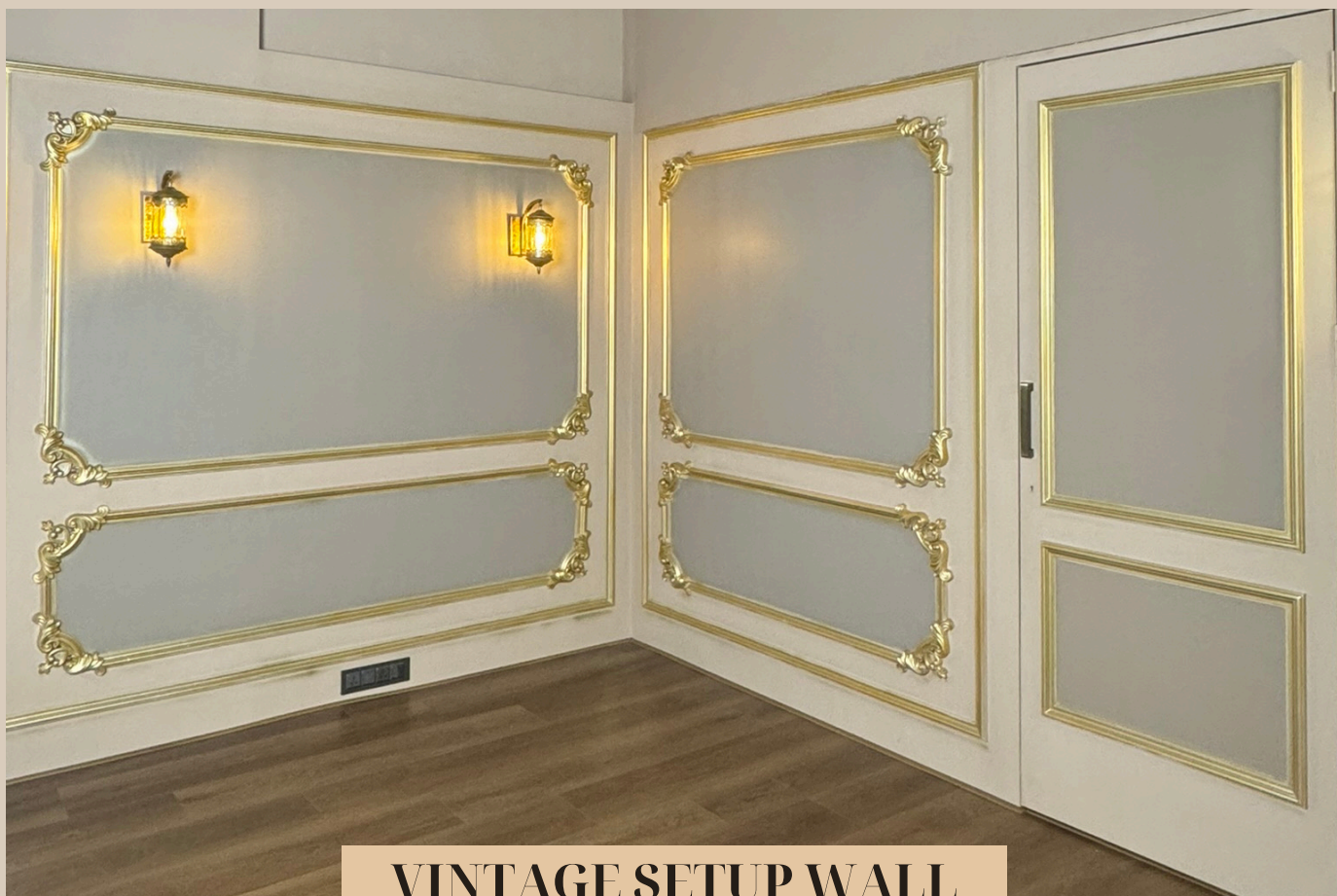
VINTAGE SETUP WALL