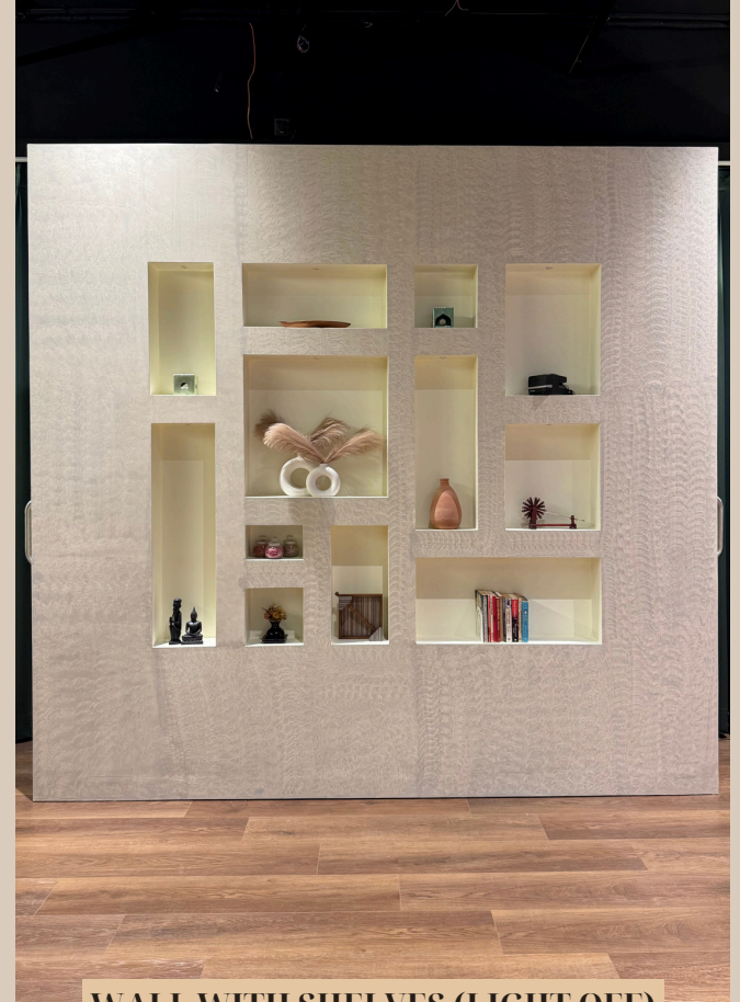
WALL WITH SHELVES (LIGHT OFF)