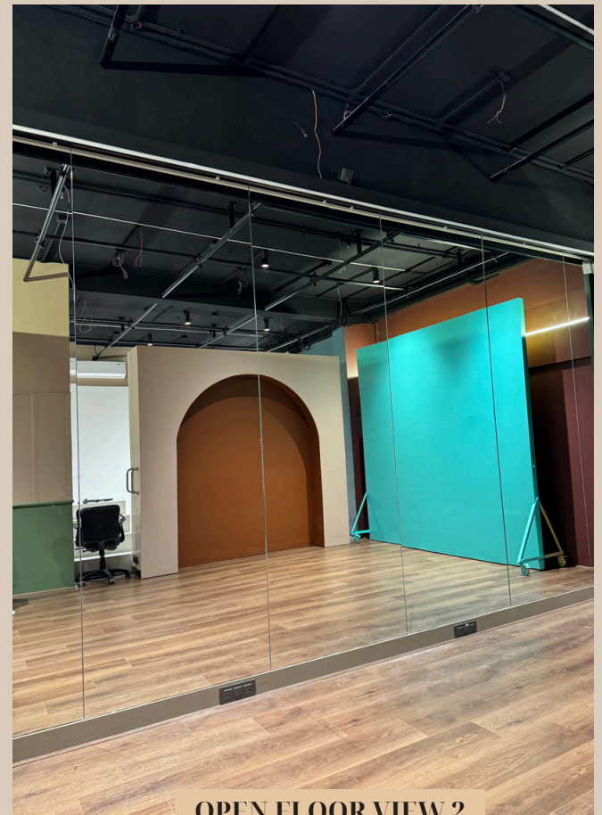
OPEN FLOOR VIEW 2