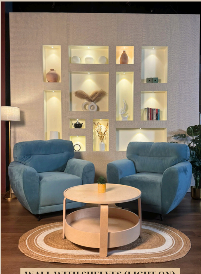
WALL WITH SHELVES (LIGHT ON)