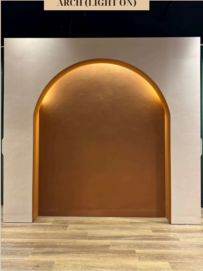
ARCH (LIGHT ON)